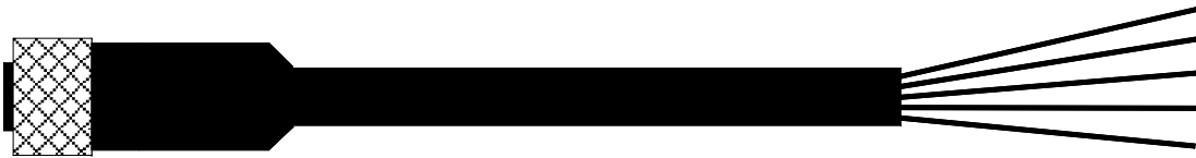
TURCK FEMALE CORDSET RK 4.5T-4/S618, ORDER NO. (4245-222)

* FOR + OUTPUT IN COMPRESSION, REVERSE THE SIGNAL LEADS AT VOLT METER. DO NOT ALTER POWER SUPPLY POLARITY.